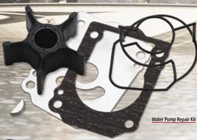
Water Pump Repair Kit