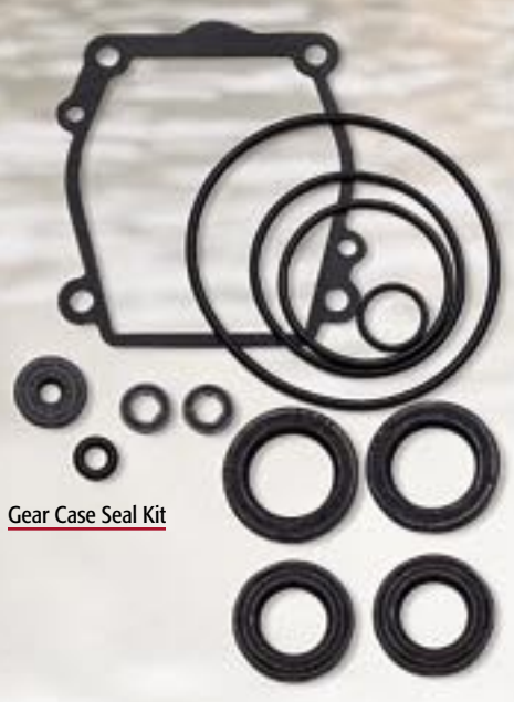
Gear Case Seal Kit