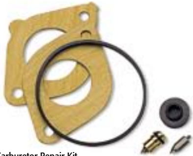
Carburetor Repair Kit